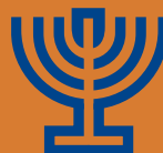
B'nai B'rith UK